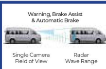
Warning, Brake Assist & Automatic Brake