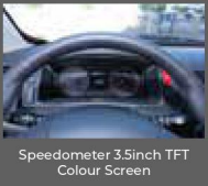
Speedometer 3.5inch TFT Colour Screen