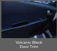
Volcanic Black Door Trim