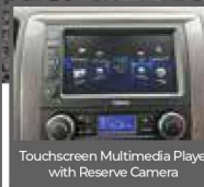
Touchscreen Multimedia Player with Reserve Camera