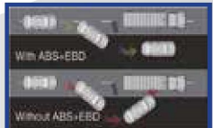
BOSCH 4 Channel ABS+EBD