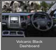
Volcanic Black Dashboard