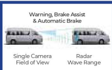
Warning, Brake Assist & Automatic Brake