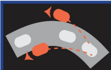
Electronic Stability Control (ESC)