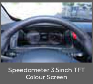
Speedometer 3.5inch TFT Colour Screen