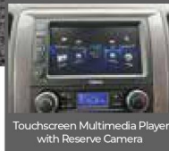
Touchscreen Multimedia Player with Reserve Camera