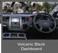
Volcanic Black Dashboard