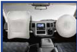
Front Dual Airbag