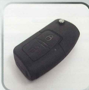
High frequency remote key