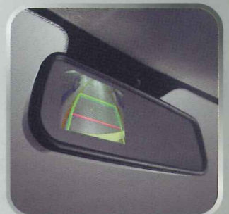
Reverse camera display