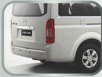
Reverse camera and reverse sensors