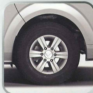
15 inches aluminium rim