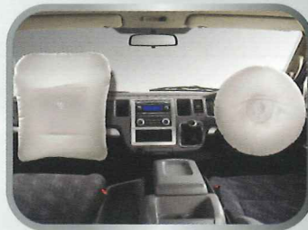
Front dual air bag