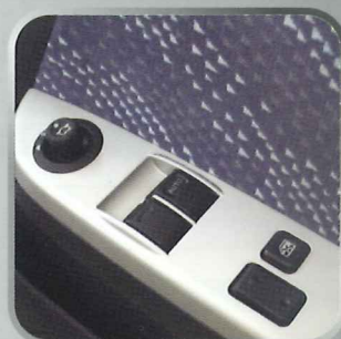
Front power window with side mirror adjustment