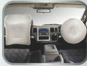
Front dual air bag