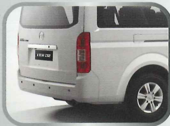
Reverse camera and reverse sensors