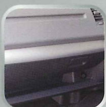
Passenger side glove box