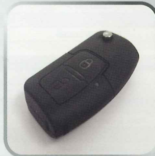
High frequency remote key