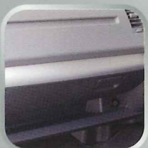
Passenger side glove box