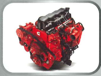
Cummins 2.8L Diesel Engine