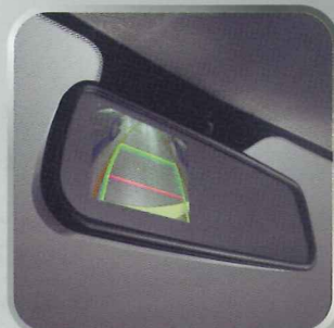
Reverse camera display