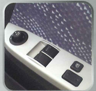
Front power window with side mirror adjustment