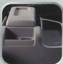
Centre console box