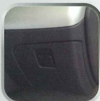
Driver side storage compartment