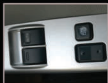
Power Window and Central Lock