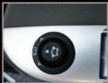
Remote Control Wing Mirror