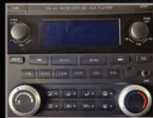
Multi-Function Audio System