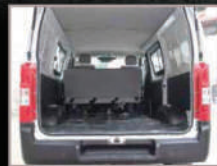
Ample Cargo Space