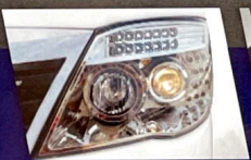
Projection Head lamp & LED Light

FACELIFTED CAM PLACER Still economy, now with: