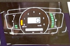
Digital Panel Meter (Available Diesel Only)