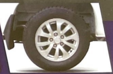
Sport Rim (Optional Accessories)