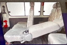
Fully Reclinable Seat Bed with Side Shift*