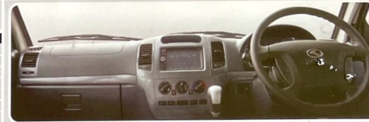
Modern Dashboard with 4-Spoke Tilt Adjustable Power Steering Wheel