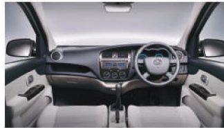
Modern and well-equipped cabin for everyday driving.