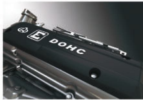
New DOHC engine for optimum performance.