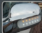
Side mirror with signal lamp & daylight