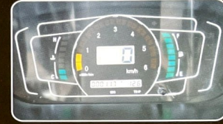
Digital Panel Meter