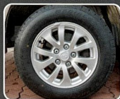
Sportrim (optional accessories)