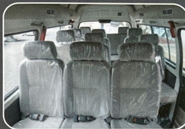
Comfortable & spacious passenger seats