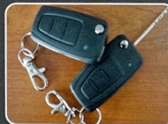
Switchblade key with remote control