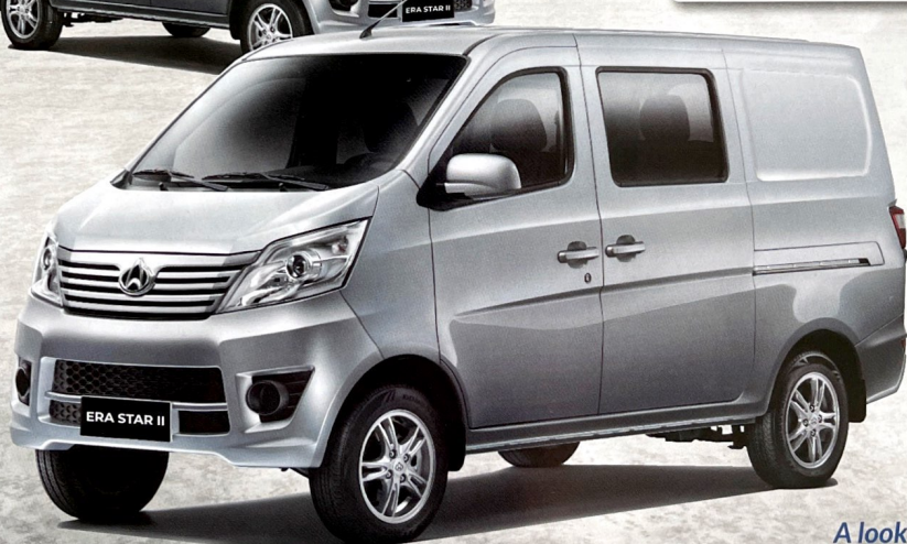
SEMI PANEL VAN