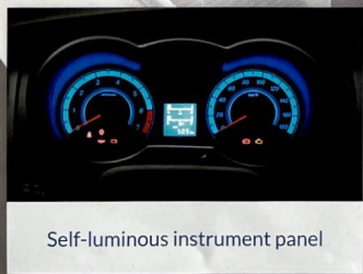
Self-luminous instrument panel