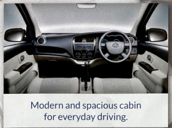
Modern and spacious cabin for everyday driving.